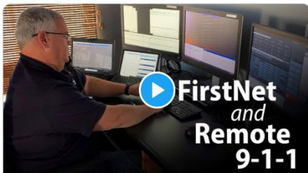
Arlington County ECC Takes on the Pandemic with Remote Capabilities The Arlington (Va.) Emergency Communications Center is one of the first in the nation to deploy remote call-taking, dispatching, and supervision capabilities.

Learn how they're deploying these innovative capabilities: soundcloud.com/user-472553784... #NPSTW2021 @ReadyArlington